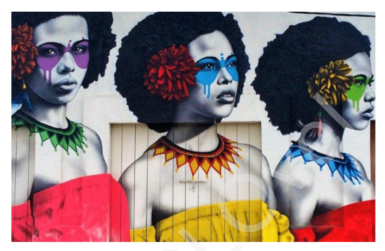
DAY 3 - PALENQUE TOUR

Today, after an early breakfast, we will visit palenque. Founded by escaped slaves during the 17th Century, this tiny village was heritage listed by UNESCO in 2005 due to its strong African linguistic, musical and cultural traditions.